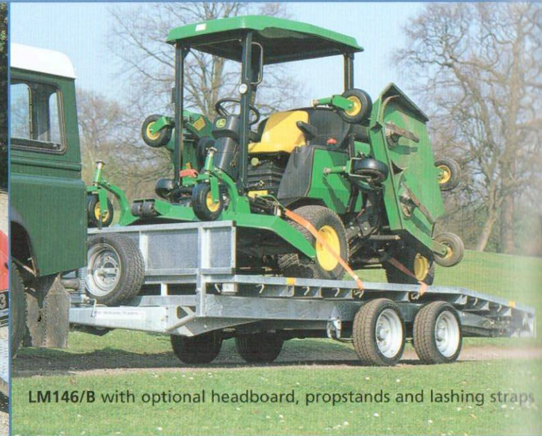
LM146/B with optional headboard, propstands and lashing straps