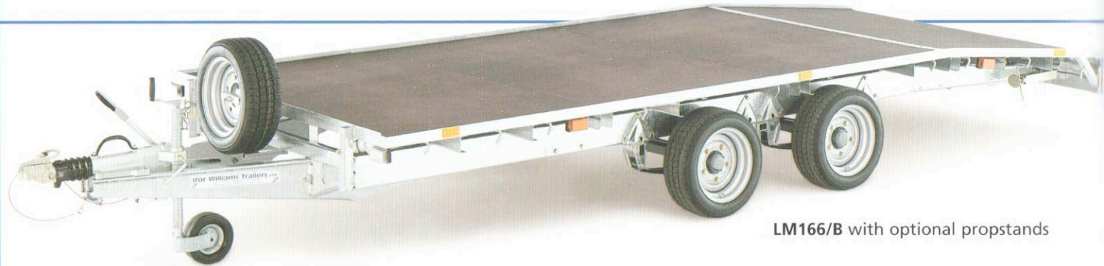
LM166/B with optional propstands

Vehicles with low ground clearance may not be suitable for loading on this type of trailer.